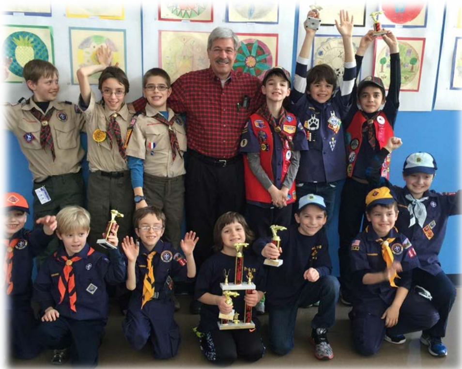
Pack 133 2016 Pinewood Derby winners with Mendham Twp Mayor Frank Cioppettini

The Pack will be taking pictures for the paper and the website, and all artistic winners should return for the Championship Race to have their photos taken.